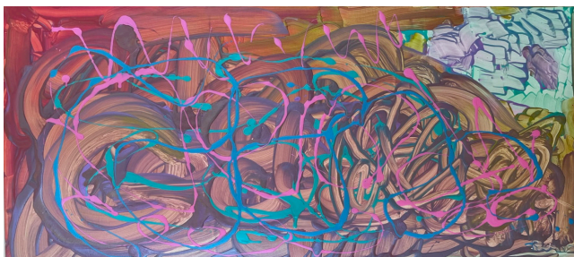
Happy Day Staten Island Day Habilitation

Creative facilitators taught introductions to mediums and encouraged diversity of expression, creative use of materials, and appreciated the insight and diversity of experience shared in discussion. The generated artwork is authentic, meaningful, and inspired!