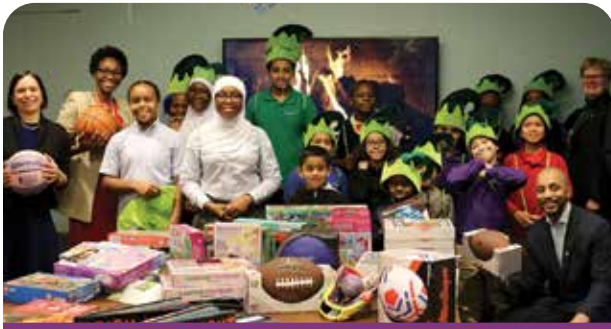
TD Bank employees welcomed spelling bee champions from Haven Academy for a special holiday event and gift drive.