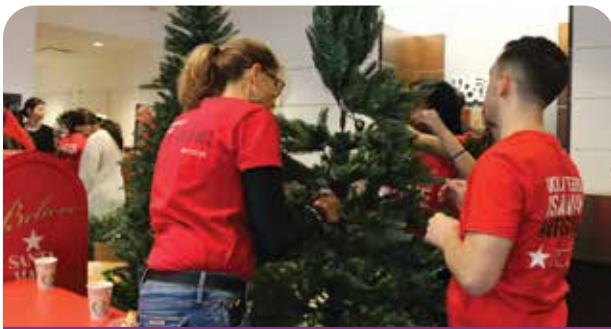
An annual tradition, volunteers from Macy's brought holiday cheer by decorating the lobby of our Chelsea location.