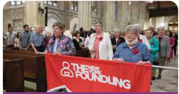
The Sisters of Charity led Foundling staff and supporters with the processional at St. Patrick's Cathedral during a special mass honoring The Foundling's 150th anniversary.