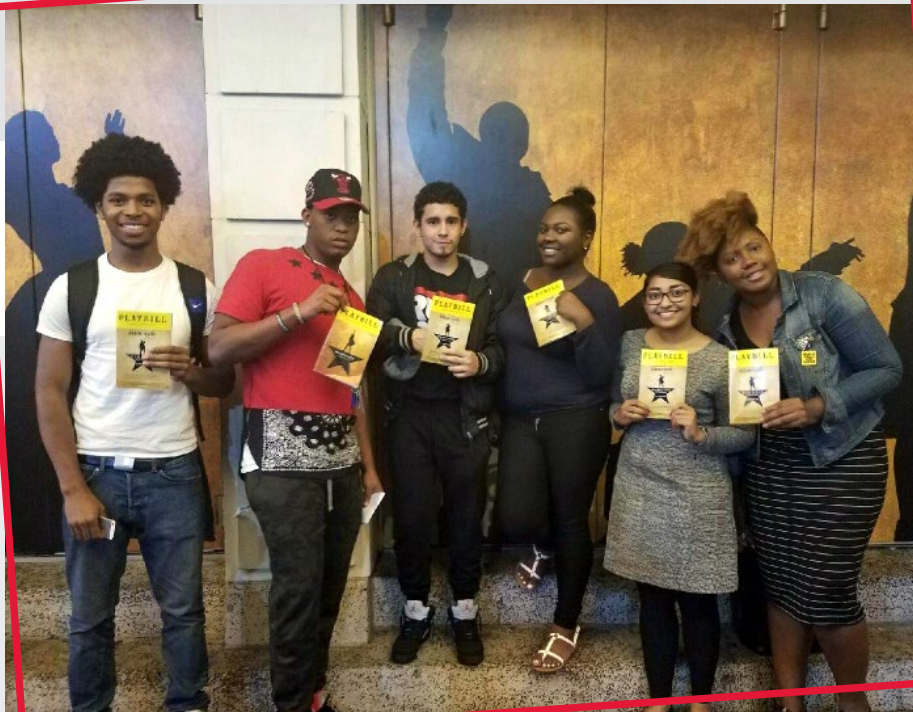
Foster youth living in The Foundling's dormitories at Queens College were able to see the coveted hit Broadway musical Hamilton.

Our vision is a community where every child and adult enjoys the safe, stable and supportive relationships needed to reach his or her full potential.